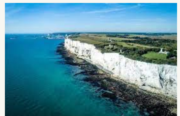
The White Cliffs of Dover

An ariel view of Dover on a map of the United Kingdom